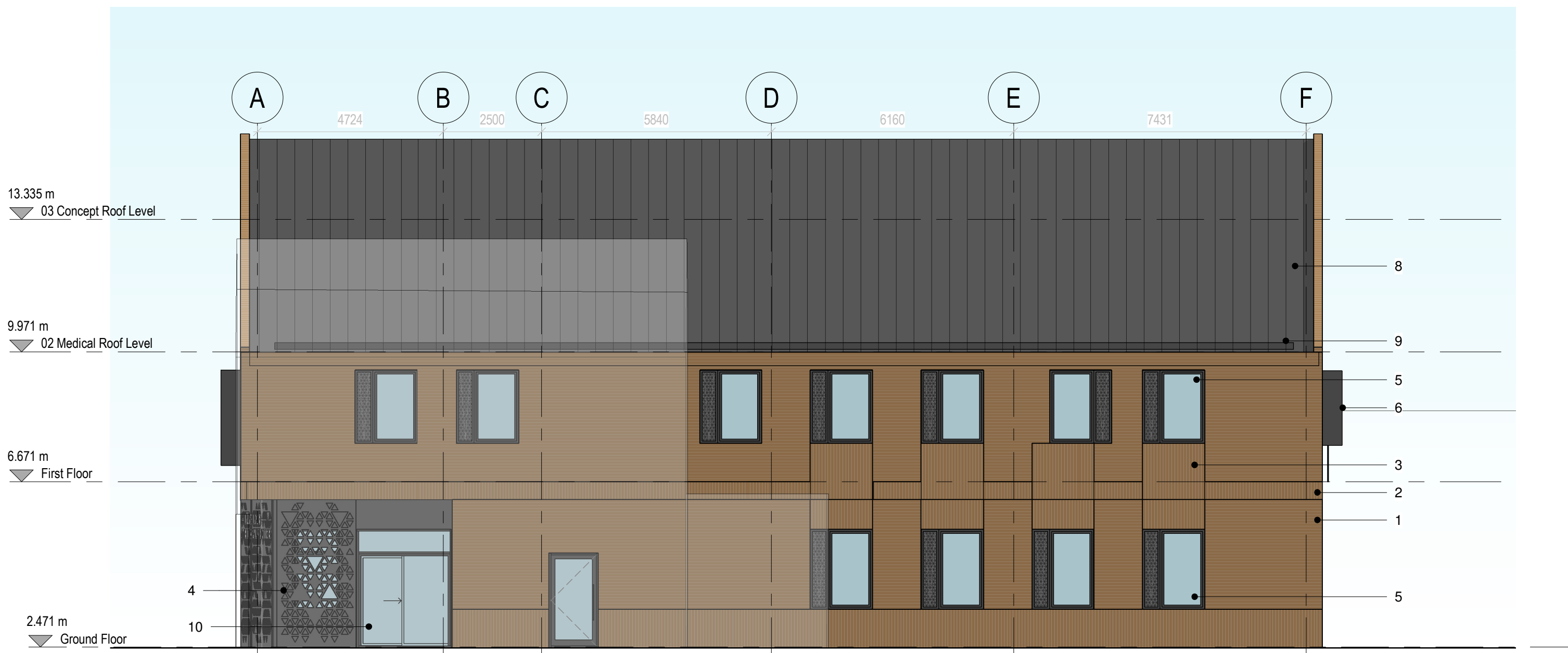
Proposed West Elevation 1 : 100