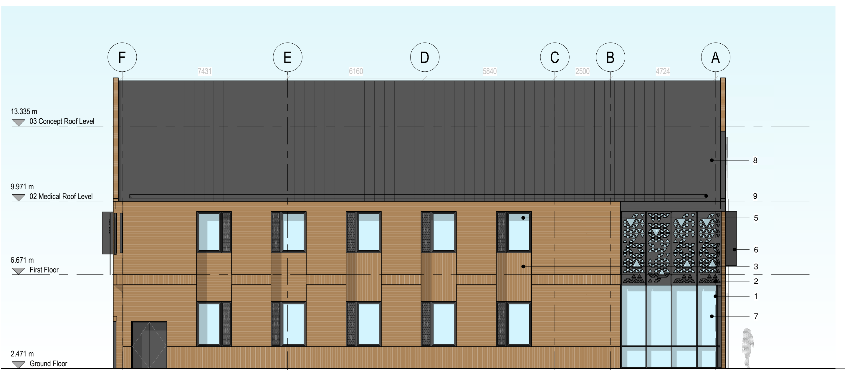
Proposed East Elevation 1 : 100